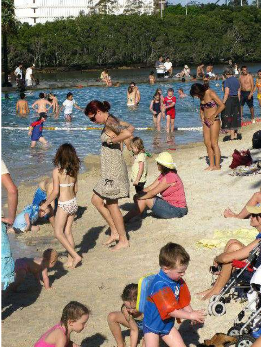
Swim at the man-made Street's Beach, a family favorite.